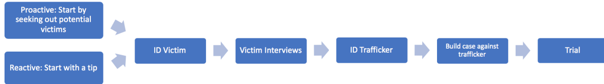
Figure 1: Overview of general investigation process

this type of activity. I'll go out there and take a look at it and see if there's anything to it. We'll conduct our own independent investigation and we'll go from there."