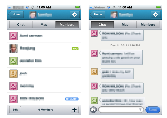
Figure 1. Two screen shots from GroupMe mobile app: Members view of G1's circle (left); Chat view of G1's circle

The cross-platform social networking application, GroupMe (see Figure 1) [24], was used in the study for three reasons. First, it facilitates the network creation process. Users can smoothly transfer existing connections offline to GroupMe members using contact information (e.g., phone number, email address) stored in their communication devices. It allowed the researchers to track those who were already involved in offline support and how they moved to online support. Another reason for choosing GroupMe was that it facilitates user-generated groupings of contacts (which we refer to "focused communication circle"). It enables users to sort their contacts so that they can selectively communicate with circle members and to broadcast messages to circles they wish to communicate with. This mechanism shapes GroupMe as a more synchronized group chat system. We expected to observe what kinds of circles the study participants created and what interactions would evolve within each circle. The main reason