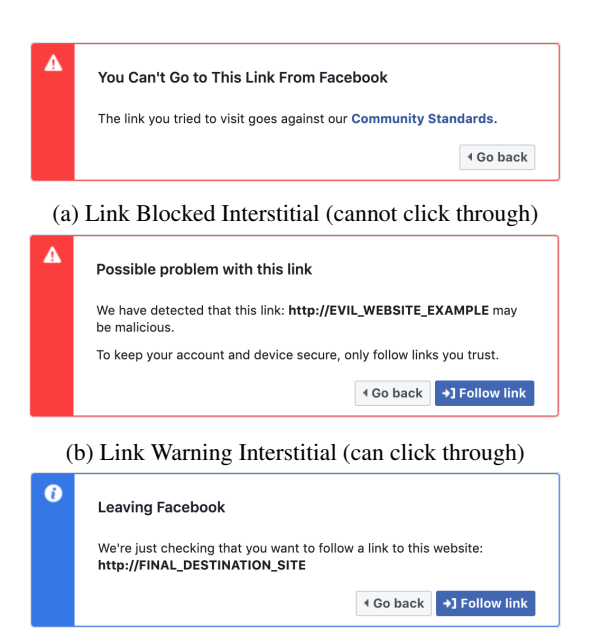
(c) Link Redirection Interstitial (can click through)

Link shimming provides navigation security and privacy protections, but also requires additional redirection hops, increasing navigation latencies. Modern browsers support several mechanisms that could serve as potential alternatives for link shimming's security and privacy functions, without impacting navigation latencies. Ideally, online services could rely on these mechanisms instead of deploying link shimming. When online services first began deploying link shimming over a decade ago [7, 32], many of these mechanisms did not yet exist, so the security and privacy value of link shimming was