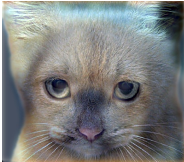
Figure 1: Look at the image from very close, then from far away.