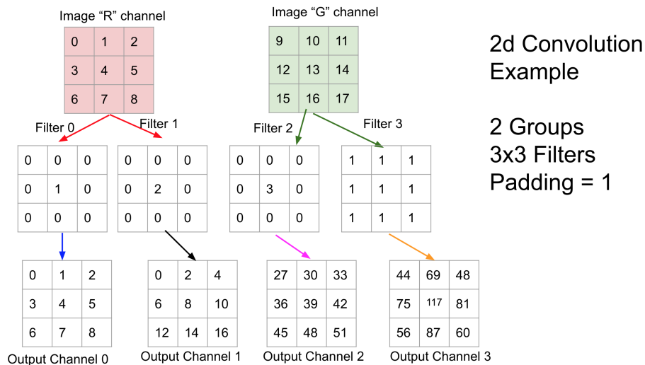
Figure 2: Visualization of a simple example using groups=2 .

We demonstrate the effect of the value of the groups parameter on a simple example with an input image of shape (1, 2, 3, 3) and a kernel of shape (4, 1, 3, 3) :