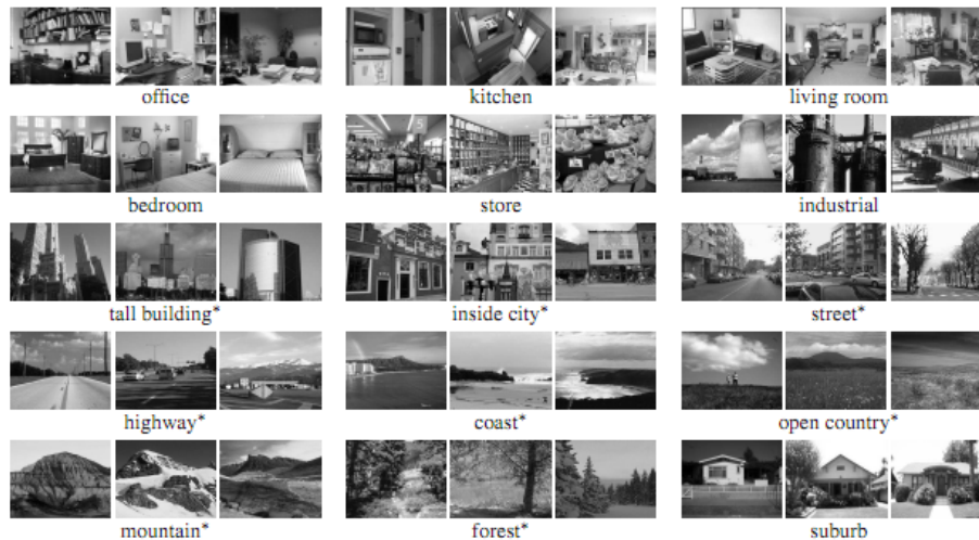
Figure 1: Example scenes from each of the categories of the dataset.

The dataset to be used in this assignment is the 15-scene dataset, containing natural images in 15 possible scenarios like bedrooms and coasts. It was first introduced by Lazebnik et al, 2006 [1]. The images have a typical size of around 200 by 200 pixels, and serve as a good milestone for many vision tasks. A sample collection of the images can be found below: