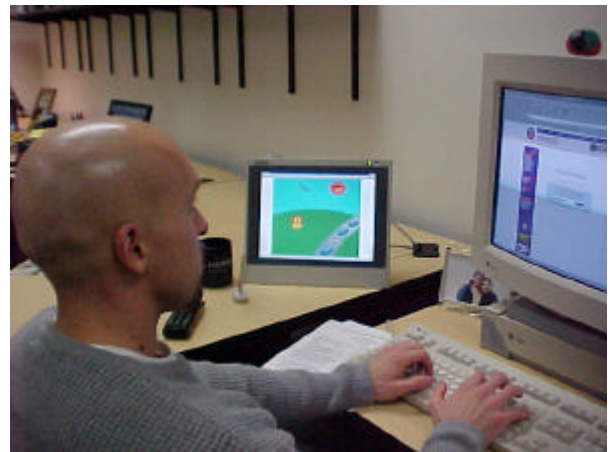
Figure 1 - The InfoCanvas in a work environment

road represent traffic conditions; and the number of flowers in a field corresponds to new email messages. Our vision is that the user will be able to specify the information sources of interest, and then “paint” a scene representing the information, effectively mapping it to the canvas. A canvas can then be run in a display device such as a flat panel LCD, where it will monitor the pertinent information and subtly update itself appropriately.