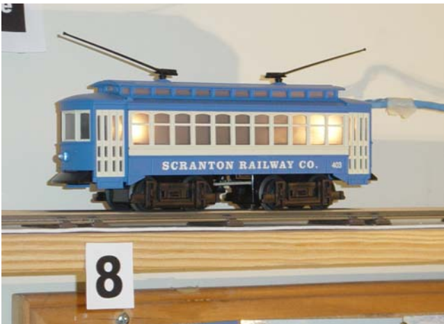
Figure 2: Ambient Trolley up-close.

The trolley car is controlled from a PC hidden nearby. A Phidgets [2,3] interface board is used to control various lights and motors on the trolley car, as well as relaying input from endpoint switches to the controller application. At regular intervals, the application retrieves a simple web page containing estimated arrival times based on GPS data provided by NextBus [4]. The