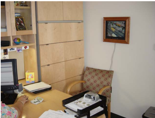
Figure 8: Example deployment of InfoCanvas.

The main idea of the system is that different objects in a scene can be set to represent different items of awareness information of interest. When the underlying data being monitored changes, then