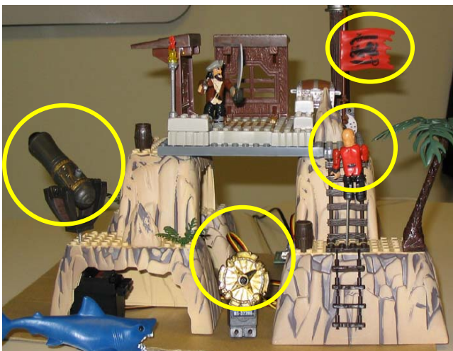
Figure 4: Pirate Island Information Display.

This project and the two others described later in the article illustrate one of the primary design goals of our work with ambient information systems, a desire to consolidate multiple pieces of awareness data within one system. Many ambient displays developed previously have focused on one particular nugget of information. In contrast, we wanted to explore whether multiple data streams could be combined into one coherent display and whether people viewing the display could easily digest all the different information.