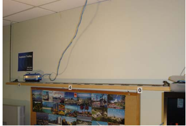
Figure 3: Configuration of Ambient Trolley showing tracks and positional markers used to indicate distance from trolley stop.

HTML is then parsed for the next predicted arrival and this value is used to reposition the trolley. The controller application itself is rather plain, allowing a user to start or stop the display, indicating the current arrival time depicted by the trolley, and providing access to diagnostic functions like moving the trolley car along the track manually.