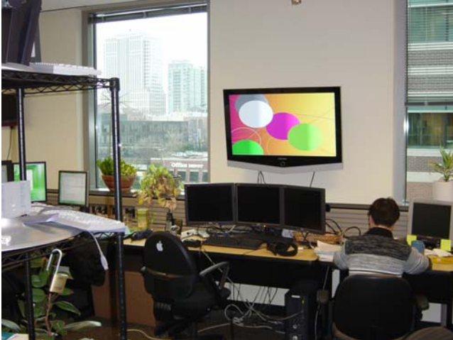
Figure 5: AuraOrbs display deployed in the laboratory.

In the AuraOrbs system, we have mounted an RFID reader on the pole of a wire shelf near our lab entrance. Lab members swipe their RFID tag past the reader when they enter and exit the lab. Software running on a computer connected to the reader detects each swipe event, determines who the person is, and updates the information display. The display control system also monitors the RSS feeds and updates the view as appropriate to the most recent information received.