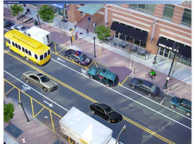
Figure 9: Sample InfoCanvas scene. Colors, appearance, and positions of objects such as the cars, lights, people, trees, etc., all indicate the present state of information of interest.

the corresponding object's representation in the scene is updated appropriately. Objects can change appearance, color, position, and size, or can be made invisible to represent different data states. For instance, in the example scene shown in Figure 9, the number of cars on the street could indicate stock performance that day or the level of traffic on a drive home. The position of the bicyclist could indicate tomorrow's forecasted high temperature or the current time of day.