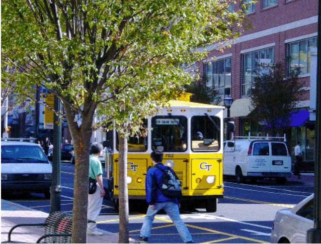
Figure 1: Actual trolley running on campus.

an awareness of the trolley’s position and suggest a good time to leave the lab to meet the trolley.