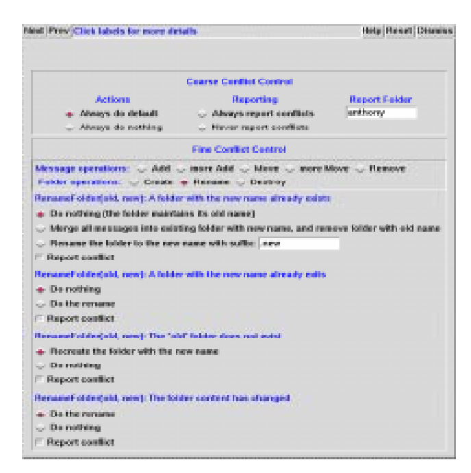
FIGURE 3: The BXMH Conflict Configuration Interface

The Bayou project is a complex, multi-person effort requiring the management of many shared artifacts. Some of these artifacts are: the Bayou server binaries, various application databases and their replicas, laptops and modems, and per-application security certificates for users. We are currently designing the Bayou Project Coordinator to