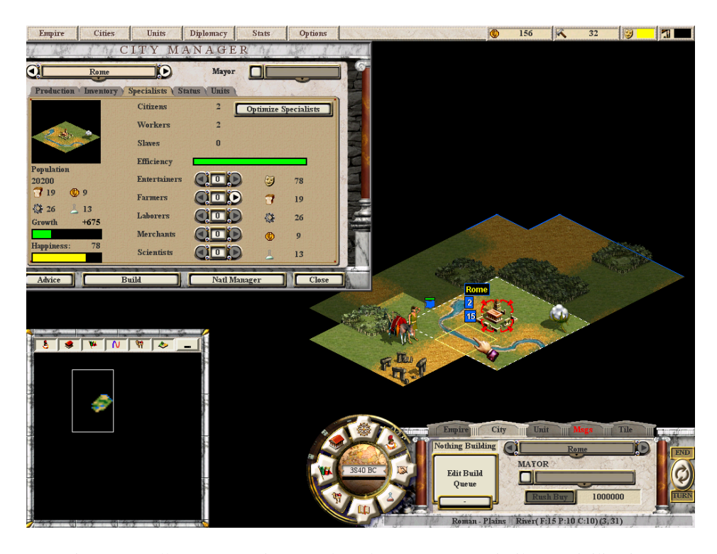
Figure 1: Call to Power II is a turn-based strategy game similar to Civilization.

provide special scientific, military or economic bonuses to the player's empire once built.