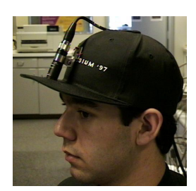
Figure 1: The baseball cap mounted recognition camera.

the resultant image that helps to prevent edge and lighting aberrations. The centroid is calculated as a by-product of the growing step and is stored as the seed for the next frame. Given the resultant bitmap and centroid, second moment analysis is performed as described in the following section.